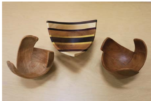
Hal Merriman turned these three pointed bowls. Interesting! The different woods are walnut, cherry, yellow heart, purple heart, maple and mahogany.