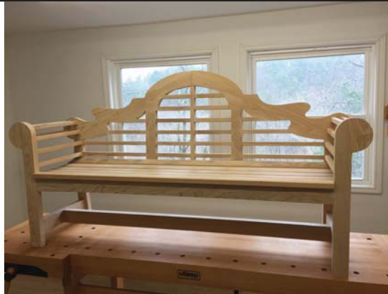
John Altholf finished this cypress garden bench just in time to be used this summer. There are 50 mortise and tenons and over 300 joints! The finish will be an exterior waterseal to protect it from the elements.