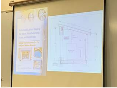
Plans for the kiln.