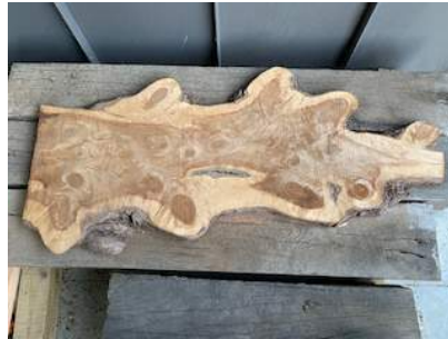
These were cut on the Wood-Mizer. Beautiful pieces that would have otherwise gone to the landfill.