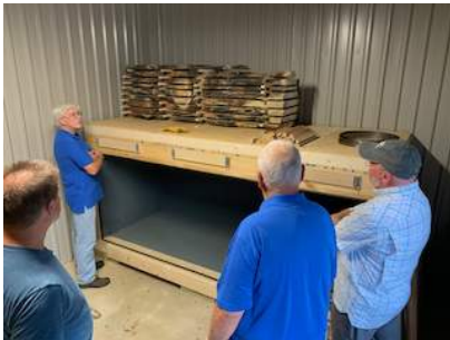
Kiln in progress.